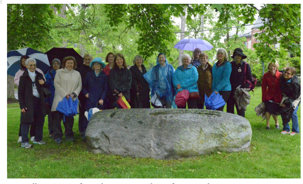
Walking Tour of Northampton - Class of 1972 45th Reunion, May 2017

WATCH FOR AN EMAIL IN FALL/WINTER WITH A SHORT SURVEY on topics / activities and speakers & discussion leaders you'd like to be part of our Reunion Program.